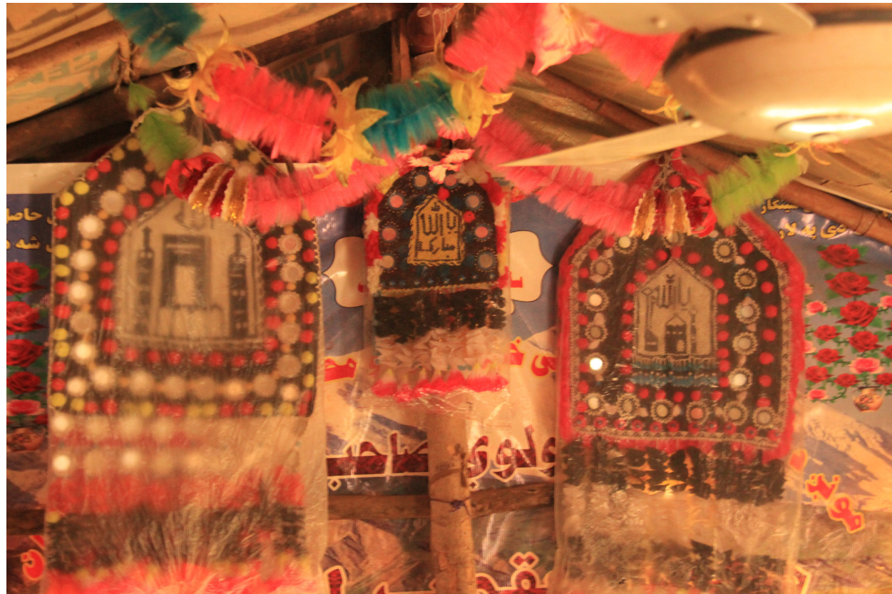
Figure 9: Hanging Decorations.

I studied in depth the design of one of the huts, named Hut 1 by virtue of being the closest to the entrance (Fig. 7). It is a 14'4" x 16' cell with a pitched roof at 6'6" clearance on the interior (Fig. 8). A central rod functions similar to a ridge board in heavy timber construction, but unlike a ridge board, it is not concealed in the ridge joint. Walls are built of rough ashlar, mud bricks, and reinforced mud plaster.