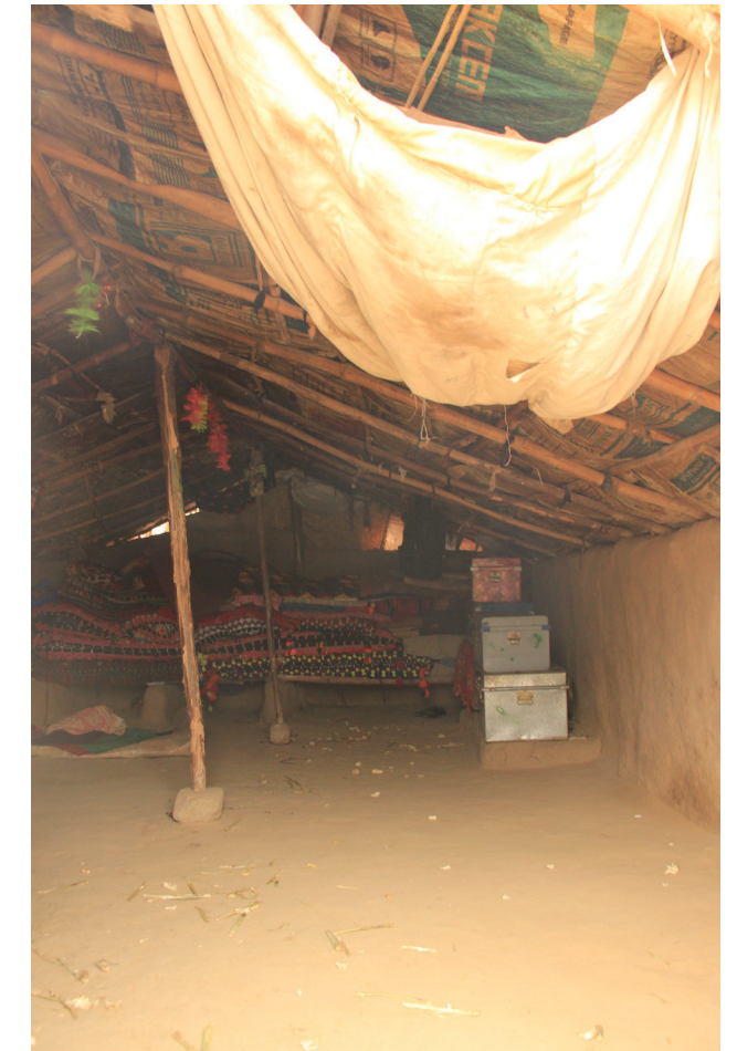
Figure 10: Modular Furniture.

The Kabuli people face certain pressures that are partly a question of public policy (getting absorbed into the sedentary, rural society) and partly a question of the marketplace (receiving support for development of their social structure, on their terms). The question of absorption has come all too often around the globe in the past sixty years. Modernity has consistently