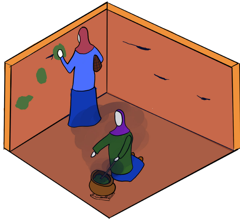
Figure 6: Housing practices, cow dung technique and burning of Khushkash.

pray as collective in a mosque, women's daily praying is atomized. They take turns to pray at the same janamaz (praying area). When men pray at home, they follow the female practice of individually performed prayers as well.