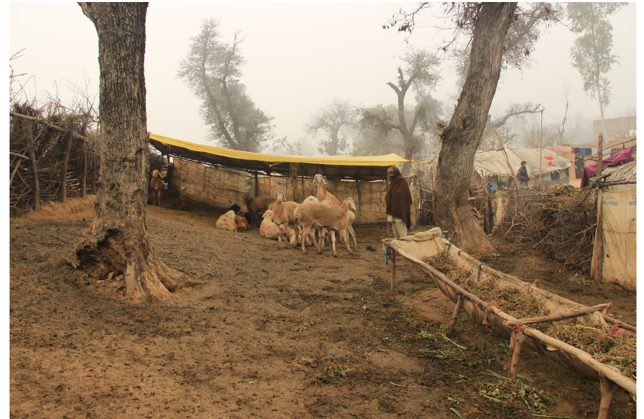
Figure 5: Animal Pen.

and adjacent to hut 4. The kitchen includes a central firepit, ornamental mud wall, ochre smudges, and floral patterns in ashes from the hearth. The intricacy and detail given to this hut show the people's precision, creativity, and expression of personal values.