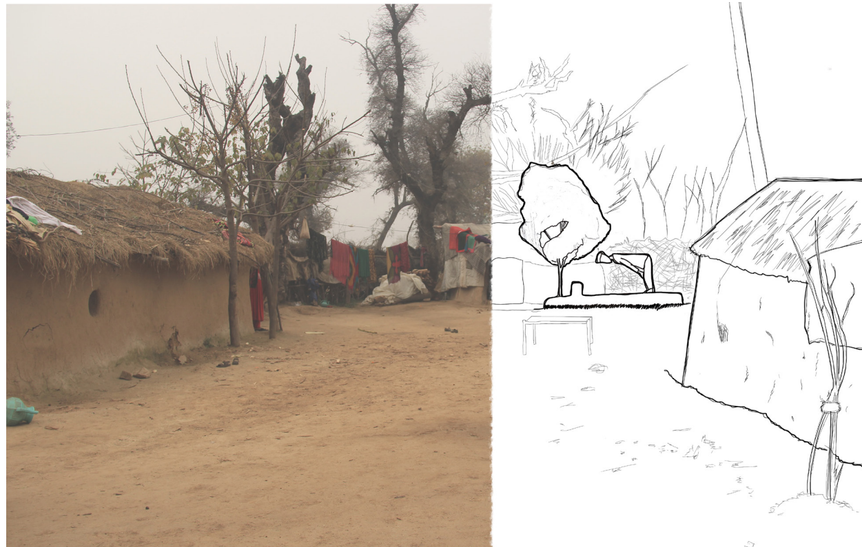
Figure 4: Prayer Area.