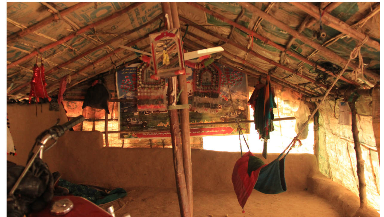
Figure 8: Hut 1 Section.