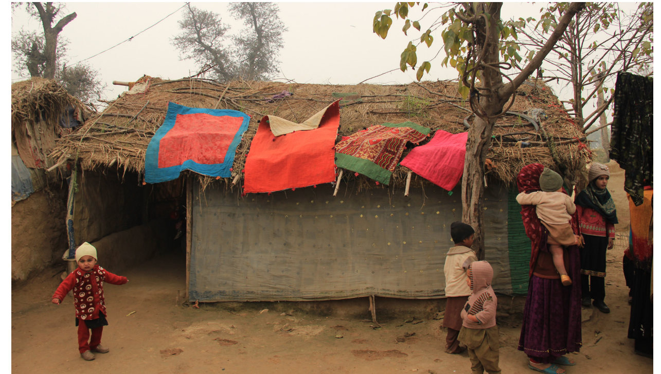
Figure 7: Hut 1.

The Kabuli people perform various rituals during the process of building their structures. Before starting construction, they people slaughter an animal, usually a goat or a sheep, drain the blood at the site of first dig, and distribute the meat among themselves and neighbors. During construction, they take two ritual breaks for the afternoon and evening prayers, and they eat a meal together. When the project is completed, they host a feast and perform prayers, and smoke the huts, animal pens, and courtyards to protect them and their bearers from the evil eye.