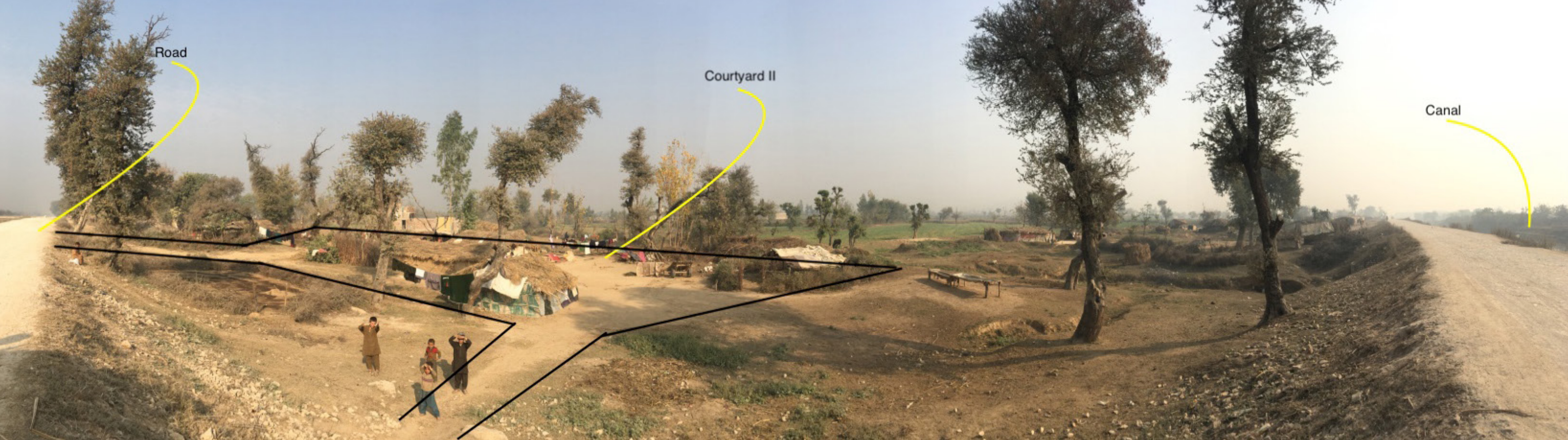
Figure 1: Camp Overview.

and the design principles of the settlement built on the commons land. When analyzing the architecture, we began to appreciate the intricate design, building strategies, skills, tools, and the collaboration between men, women, children, and elders in building this structure. It looked flimsy in the beginning, but after our analysis, this structure revealed its exceptional resilience. Though seemingly ad hoc, it was well thought-out. It could be dismissed as dull and unattractive, but it was built with great intelligence and innovation. Kabuli nomads have built a resilient community using natural materials that others view as waste. Their limited resources were offset with machine-like coordination of human capital, skills, and collective memory. The result was a green, zero-waste camp that is highly attentive to hygiene, sunlight, shade, humidity, and water-borne disease.